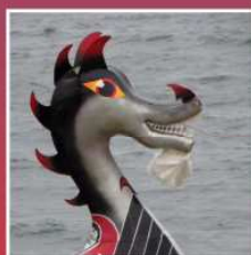
Up Helly Aa 2012