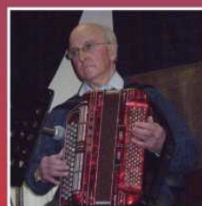
Shand Morino Gathering